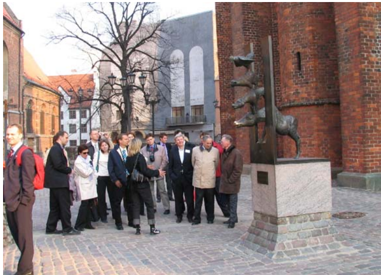
The participants of the 3 rd Workshop made a tour of the Old Riga