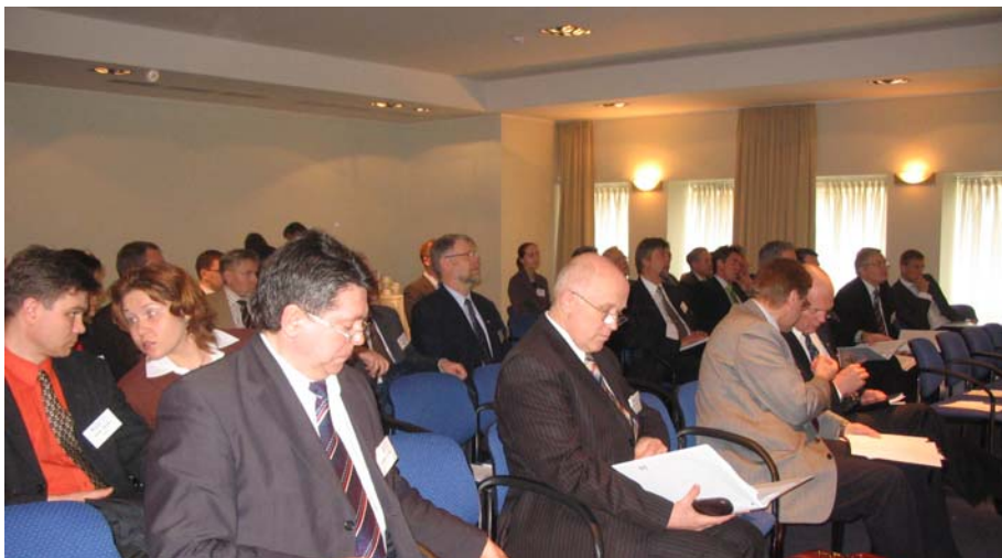
The conference hall at the 2 nd Workshop day