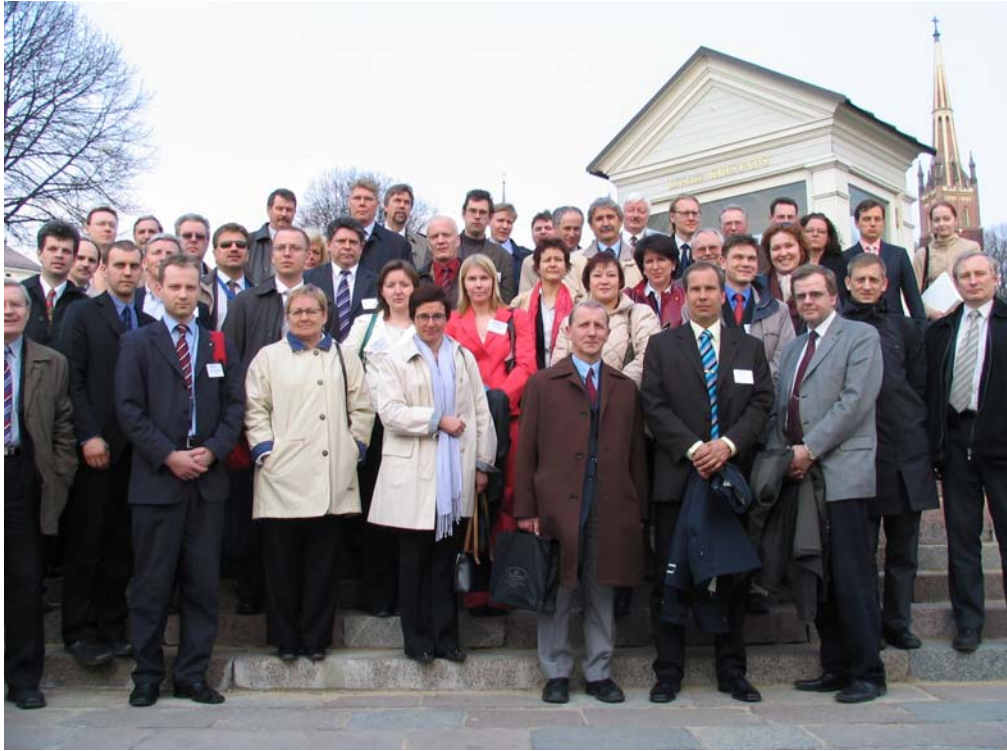
The participants of the 3 rd Workshop after visit to Freeport of Riga by boat